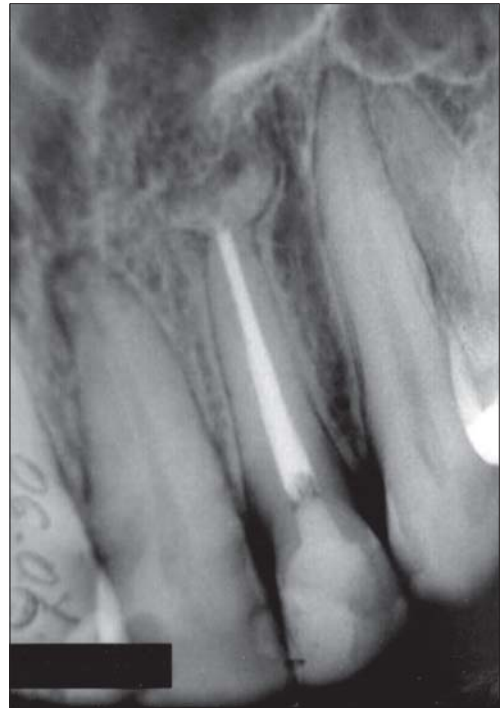
Figure. Radiograph taken 5 years after completion of the nonsurgical endodontic therapy. Note complete healing of the periradicular cyst and resorption of the paste.