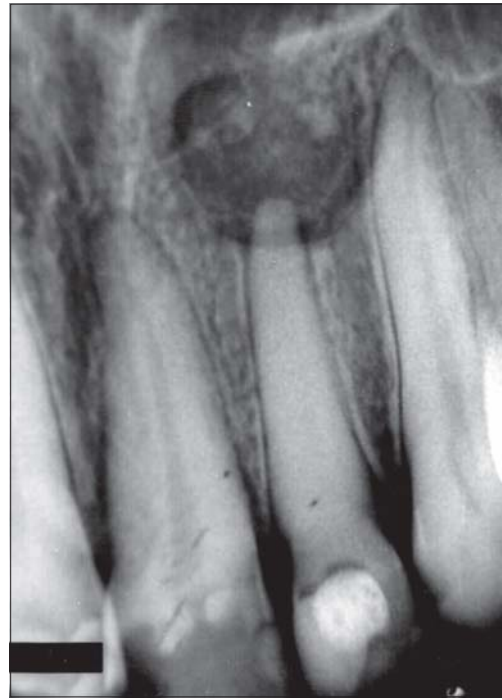
Figure 2. Radiograph taken 1 month after the beginning of the nonsurgical root canal therapy. Note the cystic cavity completely filled with the calcium hydroxide-based intracanal medication.