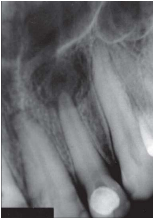
Figure 3. Radiograph taken 14 months after the beginning of the nonsurgical endodontic therapy. Note a remarkable decrease of the lesion radiolucency with partial resorption of the paste.