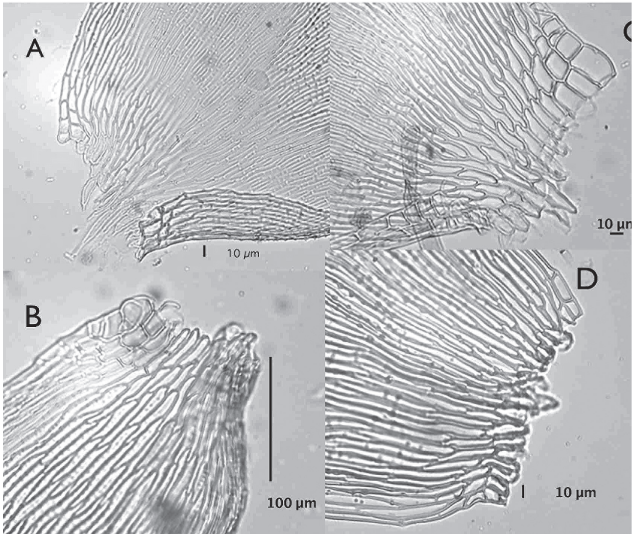
Figure 2. Differences among the alar region in the three species of Taxithelium from Brazil. A- T. juruense , B and C- T. planum ; D- T. pluripunctatum .

Brazil and also Africa. It has been misreported from Asia because it resembles the Asian species Taxithelium nepalense (Schwägr.) Broth. As stated above it is a highly variable species; leaf shape variation can be seen in Fig. 1A, B. Another useful character is its somewhat developed alar region when compared to the other two (Figure 2).