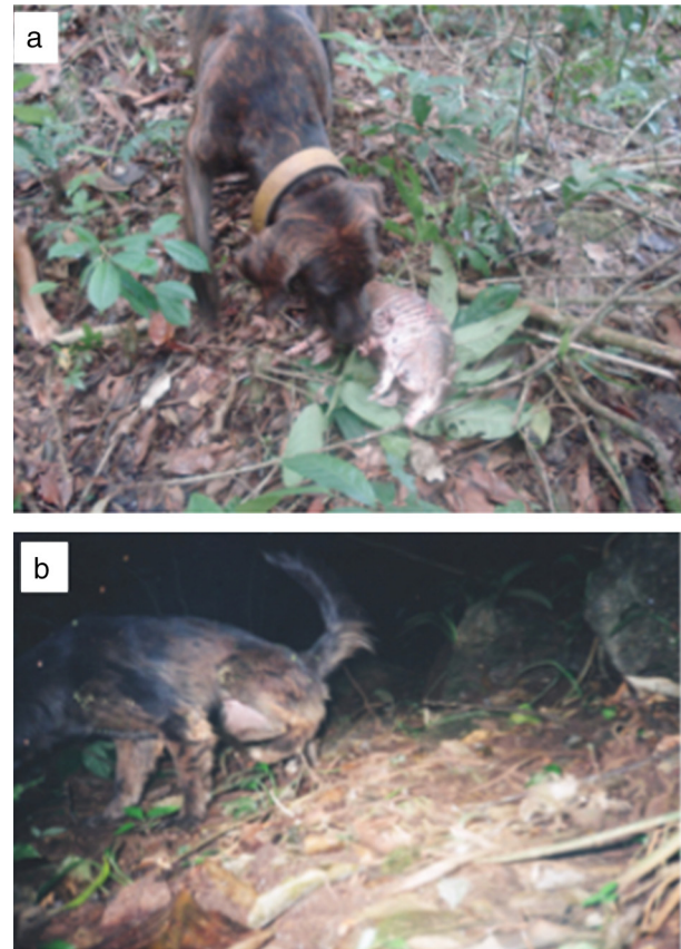
Figure 2 – (A) Domestic dog sniffing a prey ( Dasypus novemcinctus ) in the Ilha Grande State Park. (B) A female dog with territorial marking behavior registered by a camera trap in the same Park; the dog was 3 km away from the nearest village.

The presence of dogs on islands is also a matter of concern. On Ilha Grande, in Rio de Janeiro state, where 80% of the land area is protected by the Ilha Grande State Park, there is evidence of impacts by dogs as well as by domestic cats (Lessa and Bergallo, 2012) on native animals (Fig. 2A). The island's medium-size mammal populations are lower in density on the northern side of the island where human population density is higher (Lessa, 2012). Dogs in wild conditions with lactating bitches have been registered on this side of the island by camera traps more than 3 km away from urban areas, which indicates they have become feral (Lessa, 2012; Fig. 2B). Dogs were also the most frequent carnivores registered by camera traps in the entire region. Residents of the island confirm predation by dogs in forest areas as well as frequent contact between dogs and native animals (Lessa, 2012).