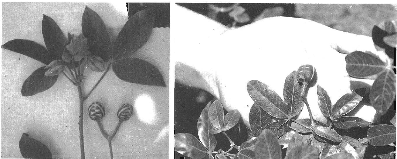
Figure 3 - Manihot neusana fruit showing marker gene of variegation.

hybrids with the above mentioned species were easily identified by the marker dominant gene of variegated fruit which came from M. neusana (Figure 3). M. neusana is a newly emerging species, described and identified recently (Nassar, 1985).