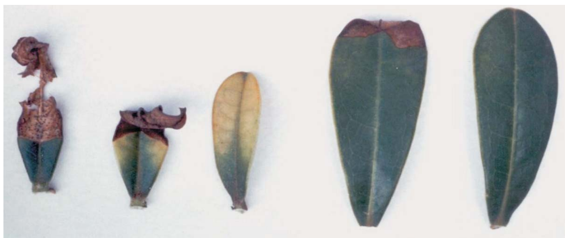
Figure 5. Recovery of the leaves of Vochysia thyrsoidea Pohl seedlings transplanted from a calcareous soil to an acid soil.