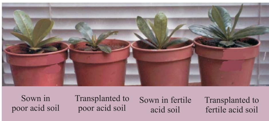
Figure 4. Vochysia thyrsoidea seedlings sown in acid soils and recovery after transplanting from a calcareous to an acid soil.