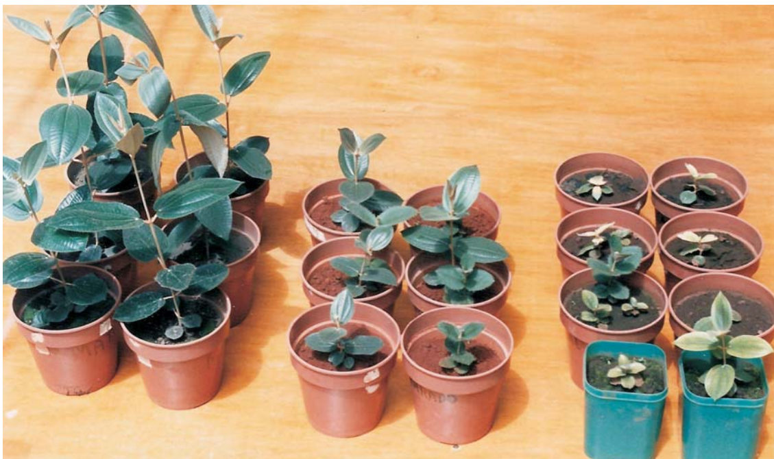
Figure 2. Seedlings of Miconia albicans (Sw.) Triana, an aluminum accumulator, growing in a fertile acid gallery forest (to the left), poor acid cerrado (center) and alkaline calcareous (right) soils. Note chlorotic leaves and stunted growth in calcareous soils.