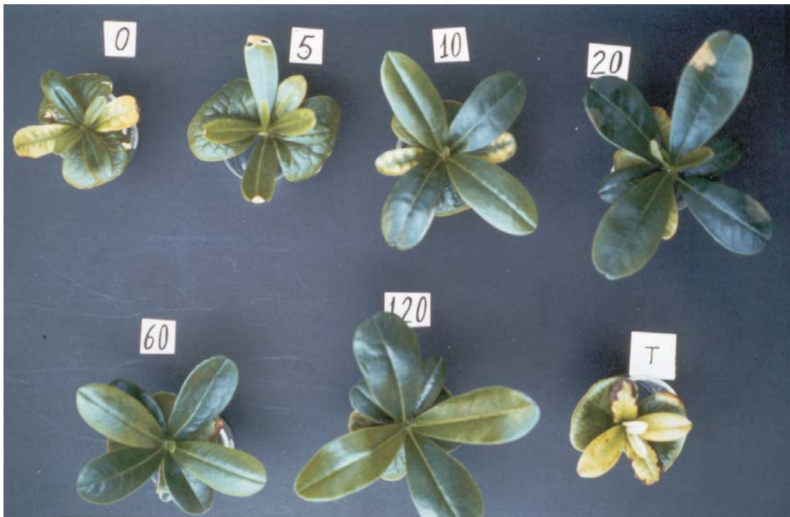
Figure 1. Chlorosis of leaves of Vochysia thyrsoidea Pohl in the absence of aluminum in the growth medium (top left, 0 mg L -1 , and bottom right, tap water) in contrast with healthy leaves in the presence of 5 to 120 mg L -1 .