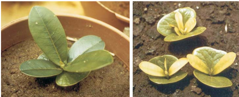
Figure 3. Seedlings of Vochysia thyrsoidea Pohl growing in an acid soil with healthy green leaves (left) and in a calcareous soil with chlorotic leaves (right).