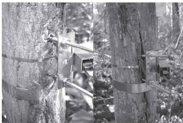
Figure 3. Damage caused by the industrial dendrometer screws to the trunks of Acacia tenuifolia (L.) Willd.: (A) resin exuding during the wet season and (B) cracks during the following dry season.

bands could be cut with common scissor to the desirable size, and the hole in the band to install the spring could be opened with a common paper hole punch. These accessories are cheap and available in many stores, contrary to professional metal scissors and punches used worldwide (Keeland & Young 2006).