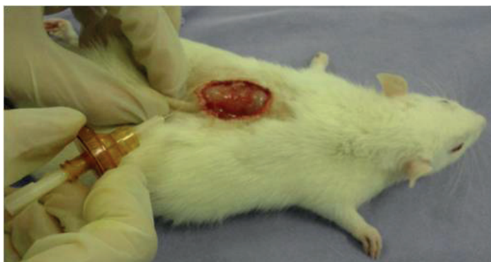
FIGURE 2 - Carbon dioxide (CO 2 ) therapy. Subcutaneous injection of CO 2 into the wound edge, with the needle directed toward the center of the wound.

CO 2 therapy was performed again at three, six and nine days postoperatively in the experimental animals. All animals, including control rats, were previously anesthetized on the days mentioned above. Neither group received occlusive dressing after application of treatment. At the end of the procedures, the animals were placed back in their respective cages under the same preoperative conditions.