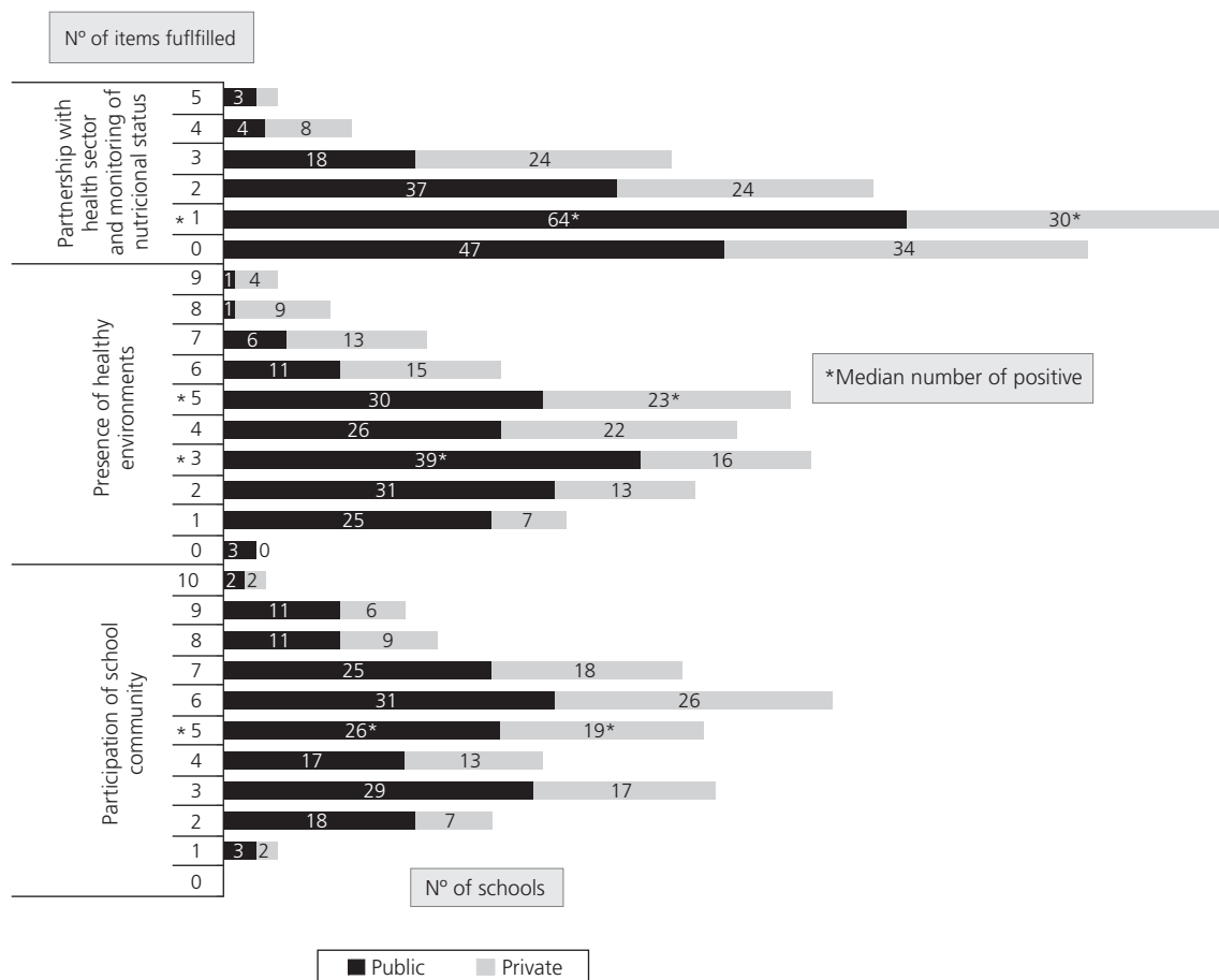
Figure 2. Characterization of schools according to fulfillment of items for the development of participation of school community, healthy environments and partnership with health sector (including monitoring of nutritional status) by type of school. Brasília (DF), Brazil, 2008-2009.

government) was used in 23% (n=26) of the schools that had no other place for cooking classes. A vegetable garden was found in 34% (n=100) of the schools and used for the promotion of healthy eating in 86% of cases. The majority of schools with a vegetable garden offered the preschool modality (72%).