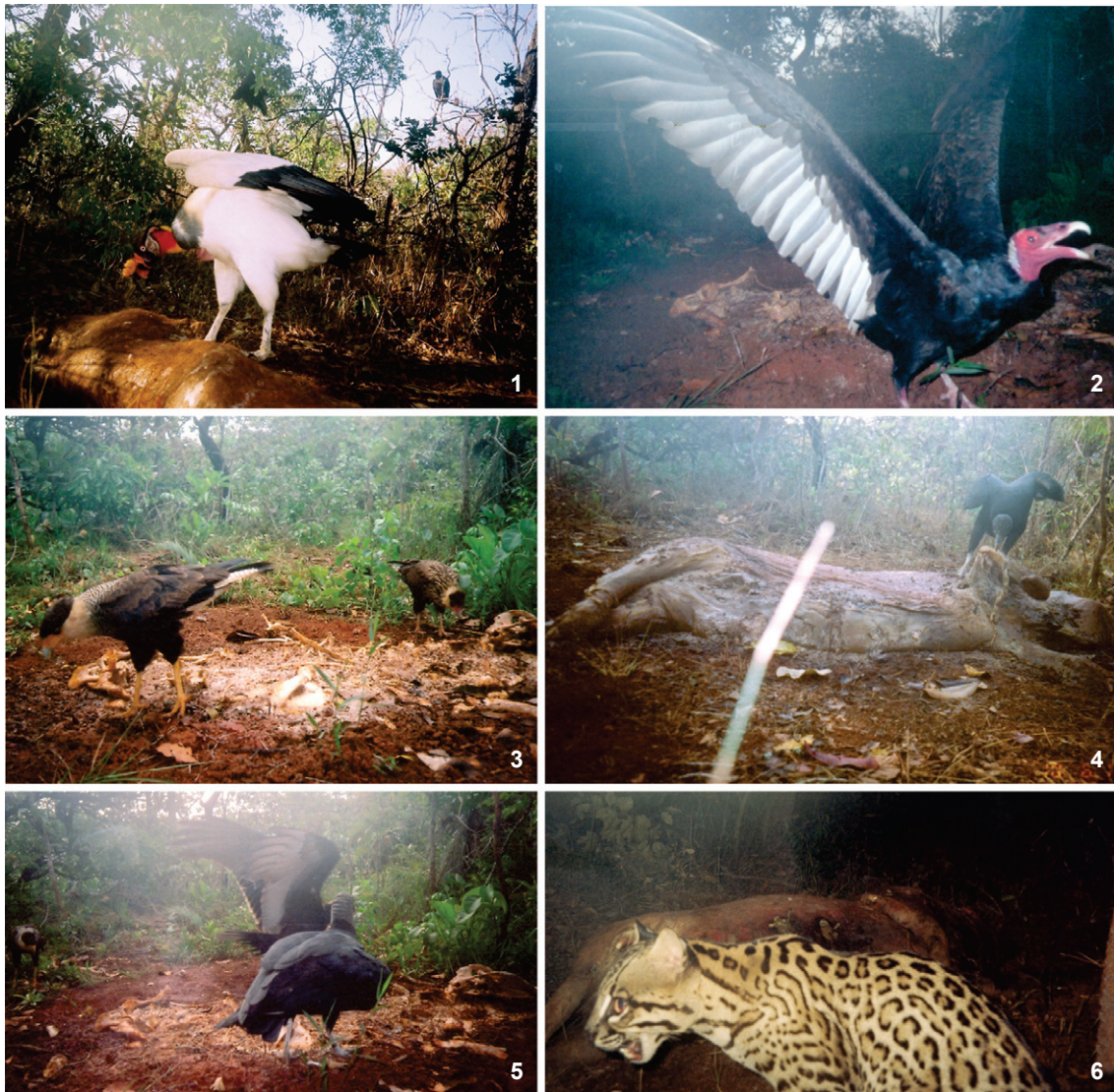
Figures 1-6. Scavenger vertebrates photographed by the camera trap using pigs carcasses as a food resource: (1) Sarcoramphus papa ; (2) Cathartes aura ; (3) Caracara plancus ; (4) Coragyps atratus ; (5) Caracara plancus and Coragyps atratus in a social behavior; (6) Leopardus pardalis .

crested caracara ( C. plancus ) is not limited to consuming carcasses, it can also eat the remains around it, beetle larvae and other insects that move away from the body. As a result of the intense activity of C. atratus on the carcasses, large bones, for instance the scapula and femur, were taken about six meters away from the site of decomposition. The desarticulation and transport of flesh and skeletonized remains is a well-known phenomenon attributed to scavenger birds, especially vultures (REEVES 2009, SPRADLEY et al. 2012).