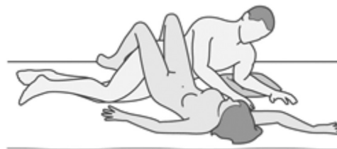
Fig. 3 – The patient has constraints to hip and knee mobility. In addition to the comfort provided by the reduced amplitude of movement, this position allows reducing the effort required for postural maintenance. Arthritis Information: Sex and Arthritis; reproduced with permission from Arthritis Research UK.

In addition, the alignment of the spine, hip and knee joints can be maintained with the aid of pillows and cushions, decreasing the pain.