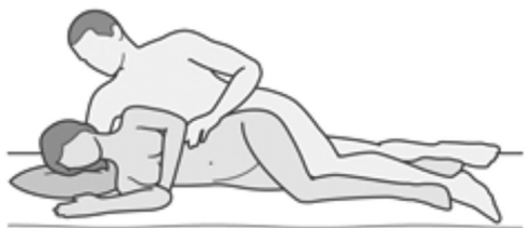
Fig. 2 – Lateral decubitus position; reduction in hip and knee range of motion, as well as low back spine alignment. Arthritis Information: Sex and Arthritis; reproduced with permission from Arthritis Research UK.