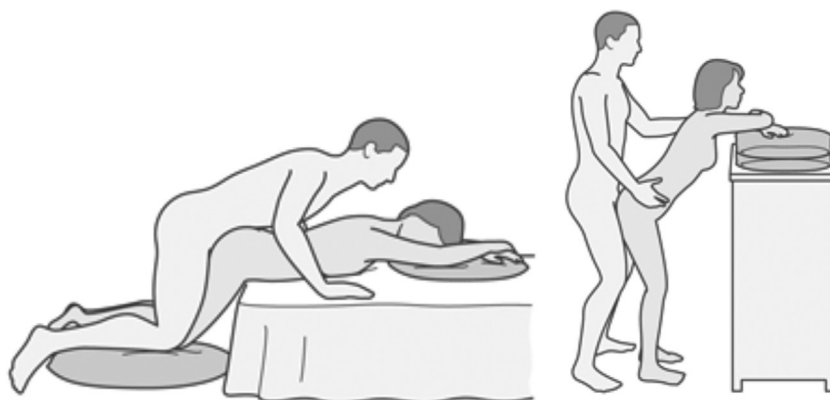
Fig. 4 – In both situations, the patient leans on the bed or furniture, avoiding weight bearing on the upper limbs and the completion of sexual activity with reduced mobility of hip and knees. Arthritis Information: Sex and Arthritis; reproduced with permission from Arthritis Research UK.

Due to the multiplicity and complexity of forms of sexuality expression, the approach of patients with sexual dysfunction involves broad aspects and hard-to-approach themes, whose handling requires the formation of bonds and an environment enabling the understanding of aspects beyond physical complaints, for instance, emotional and social factors. 2,14,27