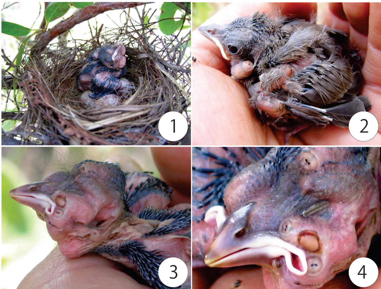
Figures 1-4. (1) Nest of Neothraupis fasciata (Lichtenstein), (Passeriformes, Thraupidae) with parasitized nestlings; (2) Nestling of Neothraupis fasciata (Lichtenstein), (Passeriformes, Thraupidae) parasitized with Philornis torquans (Nielsen) subcutaneous larvae; (3) Head (dorsal view) of a nestling of Neothraupis fasciata (Lichtenstein), (Passeriformes, Thraupidae) with parasitized with Philornis torquans (Nielsen) subcutaneous larvae; (4) Head (dorsal-lateral view) of a nestling of Neothraupis fasciata (Lichtenstein), (Passeriformes, Thraupidae) with parasitized with Philornis torquans (Nielsen) subcutaneous larvae.

The flies specimens were collected at the Estação Ecológica Águas Emendadas (ESECAE), Distrito Federal, Brazil, a protected area in the Brazilian Cerrado, during a nesting monitoring program (Marini et al. , 2012). Neothraupis fasciata is a common species in this reserve where it breeds during the wet season from September to January (Duca & Marini, 2011), and where its biology has been studied in detail (Duca & Marini, 2011, 2014a, b). The larvae and pupae were collected by one of authors (CD) from nestlings of N. fasciata during October-November 2003-2005 (Figs. 1-4). The larvae were intra-dermic in the nestlings and the pupae were collected