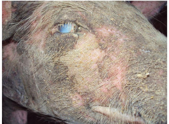
Fig.1. Ocular injury by calcium oxide in swine. Corneal opacity. Face with multifocal areas to blackened coalescent (burns) on the face.

The diagnosis of skin burns and cornea ulcer by virgin lime in pigs was performed by the historic and clinical-pathological alterations. Reports of chemical burns associated to virgin lime are little described in animals (Coward et al. 2000) In swine is reported an outbreak with high mortality (63.6%) after exposure to the combination of hydrated lime and sodium bicarbonate (Coward et al. 2000). In humans these accidents are frequent. The victims are usually of the male gender, young, and ordinarily with occurrence in the work or domestic place (Castellano et al. 2002). Epithelial necrosis