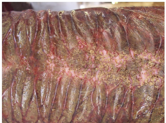
Fig.3. Skin burn by calcium oxide in swine. Dorsum region with formation of papules, vesicles and high firm, parched and brown plates.