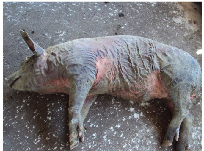
Fig.2. Skin burn by calcium oxide in swine. Dorsum and lateral surface of diffusely blackened and liquefied limbs. Erythematous areas on the skin (axillae and groin).