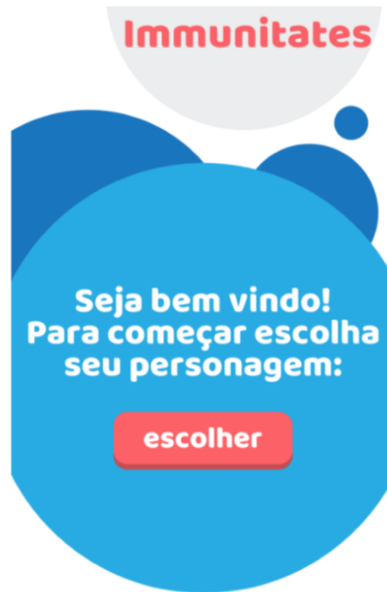
Figure 1. Welcome screen.