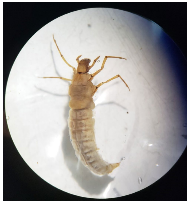
FIGURE 1 Picture of Phylloicus sp. (Trichoptera: Calamoceratidae) observed electronic magnifier glass

In the experiment, we used 80 containers (Cerrado = 40; Amazonia = 40) with a single Phylloicus larvae to avoid interactions between individuals (e.g., aggression and competition) that could interfere in the consumption results. The effect of litter quality was assessed by providing leaf litter of M. guianensis and I. laurina in five different ratios of number of disks (A = 100% of M. guianensis ; B = 75% of M. guianensis , and 25% of I. laurina ; C = 50% of both; D = 25% of M. guianensis and 75% of I. laurina ; and E = 100% of I. laurina ) to Phylloicus larvae. These five ratios were repeated in two treatments regarding the quantity of organic matter where the first with four leaf disks (Lower quantity) and the second with 12 leaf disks (Higher quantity) in each container highlight that there were 4 replicates per quantity × quality treatment level in the text (as shown in Figure 2).