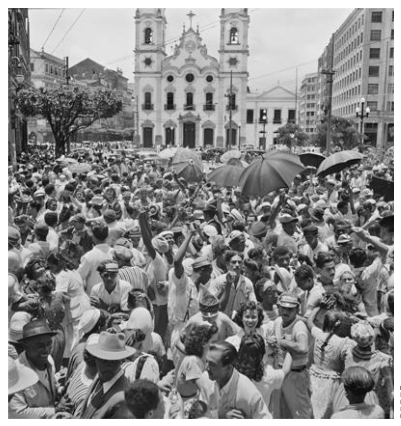
Fig. 4: Street Carnival in front of Santo Antonio Parish Church.

A decade later, the carnival in the Pracinha was again the object of photographic record, now through Gautherot's lenses (Figure 4): Santo Antonio Parish Church in the background and in the very foreground, perhaps to the sound of "Evocação" (Ferreira, 1957), the photographic window opened by Gautherot shows a cordon, on the other side of which you can see the street floor where the participants' carnival unfolds, while on this side is a catwalk made of planks covering the street floor hosts a carnival spectacle. According to Lima (2018, p. 230), in the 1950s, the carnival was institutionalized, becoming the responsibility of the municipal government, and, as such, lost much of its free character. It is also Lima (2018, p. 226) who