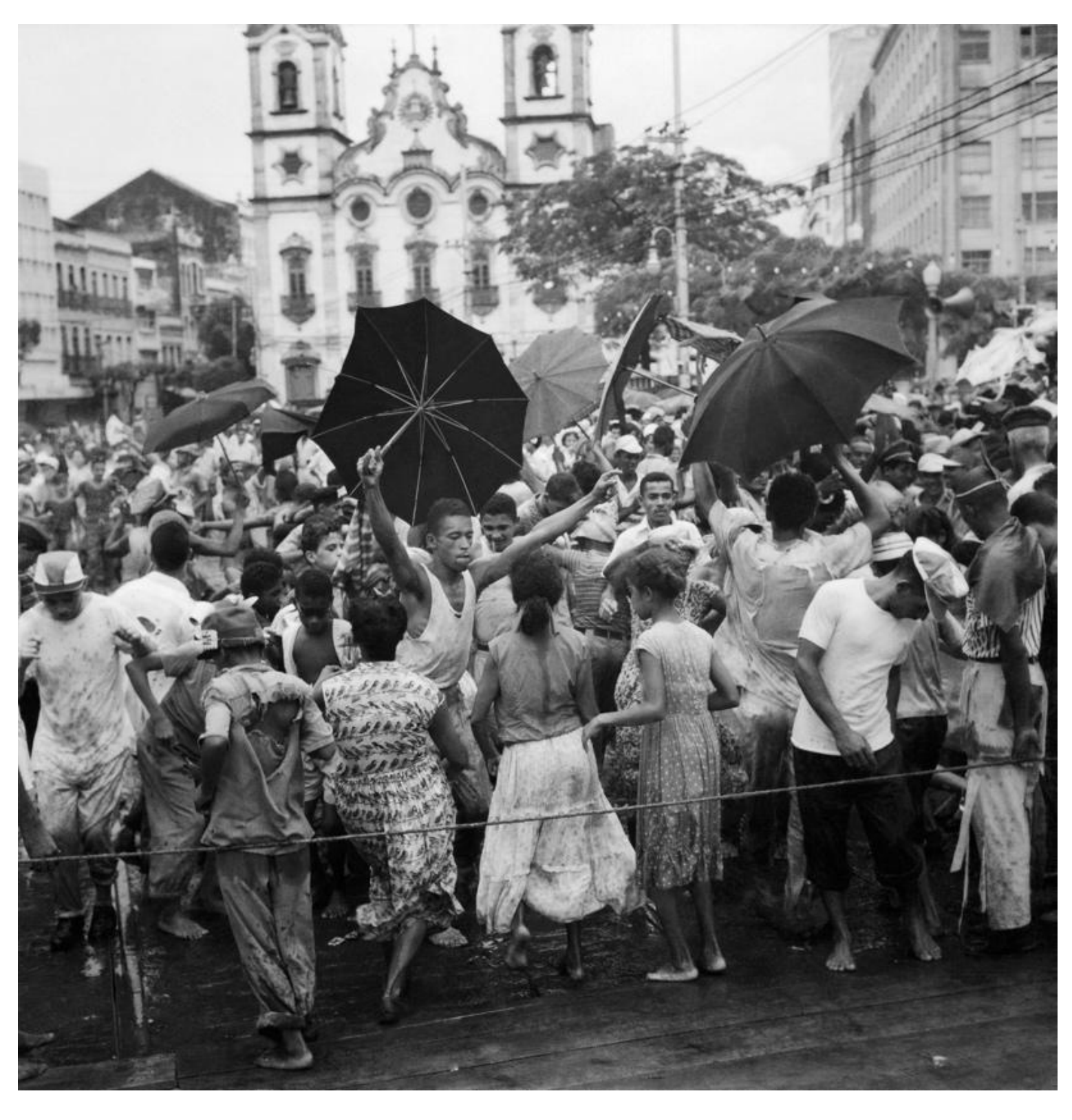
Fig. 3: Recife.