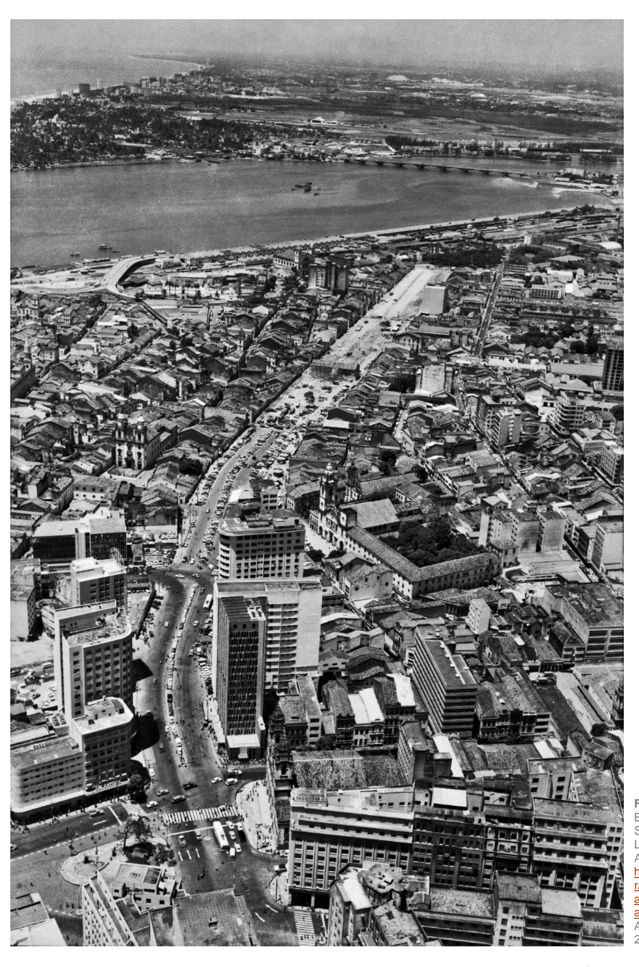
Fig. 1: The Dantas Barreto Avenue.